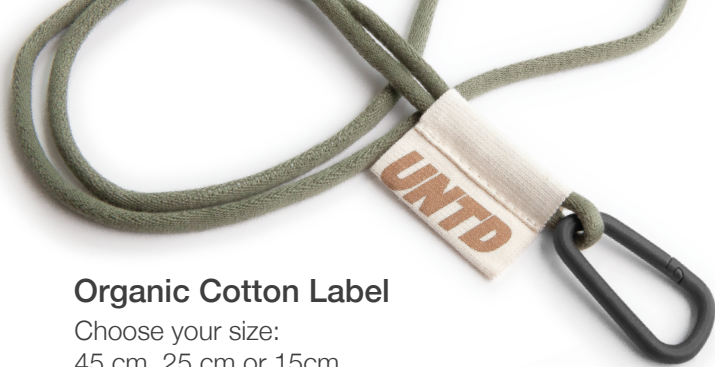
Organic Cotton Label

From Lanyards made with organic cotton or recycled polyester to notebooks, wristbands and lanyards made with a biodegradable composition.