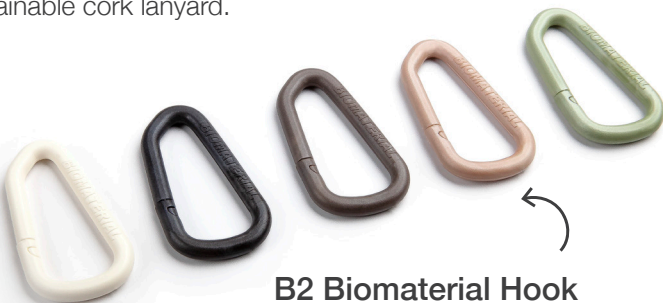
B2 Biomaterial Hook