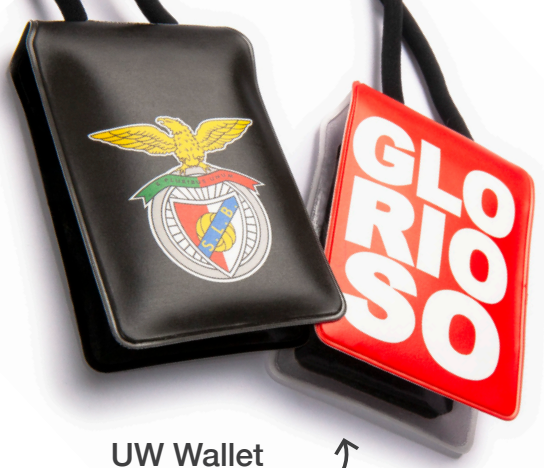
UW Wallet Promo Wallet with customizable exterior.