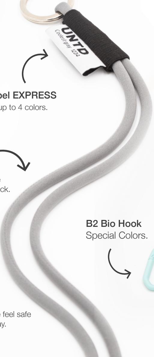
B2 Bio Hook Special Colors.