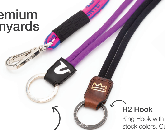
R3 Ring Eye catchy ring with 4 available stock colors. Customizable with your logo.