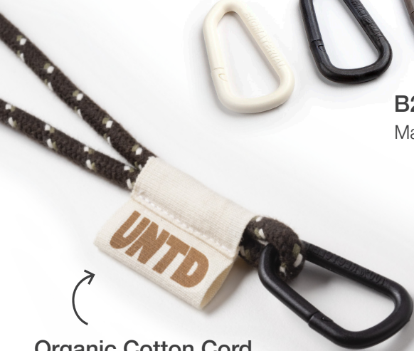
Organic Cotton Cord