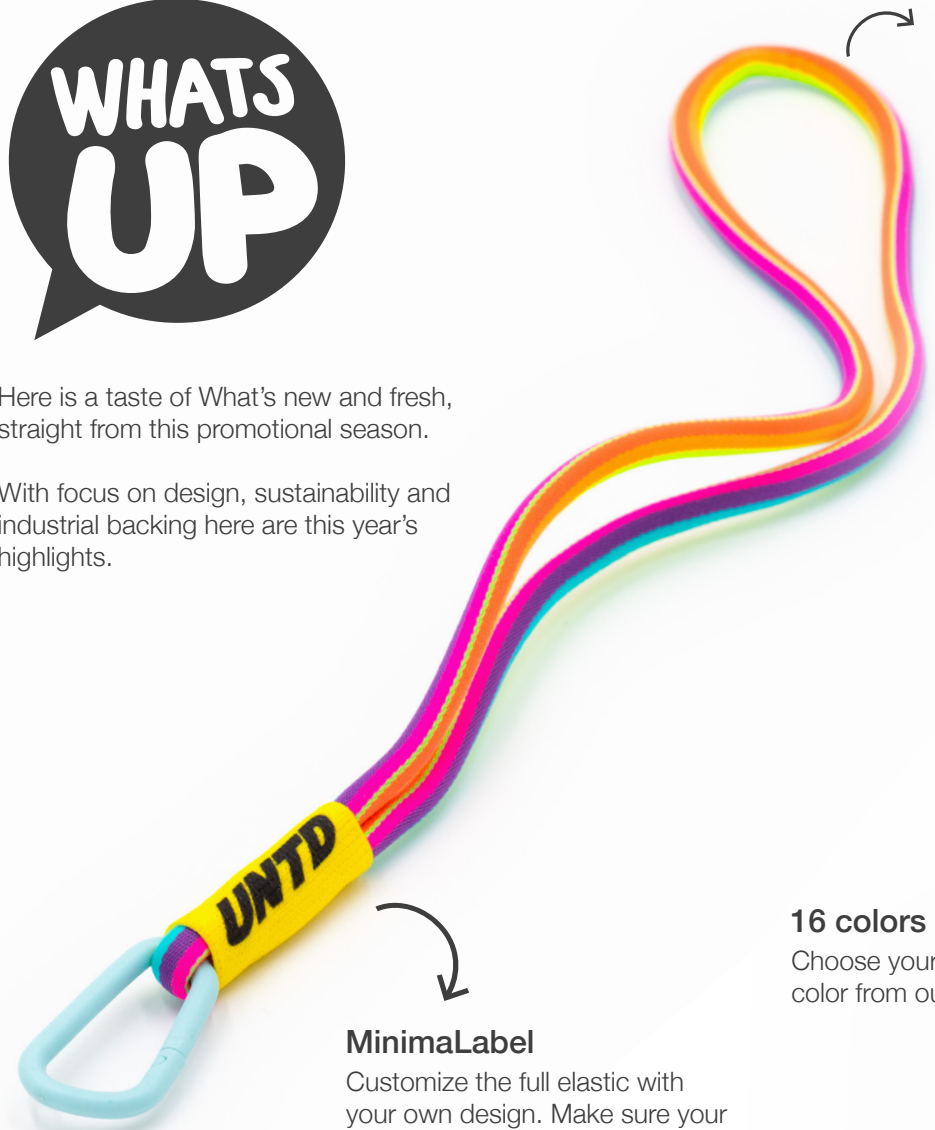
B1 Hook - Recycled Available in Black (Recycled) and Blue (Recycled Ocean Plastic).

With focus on design, sustainability and industrial backing here are this year's highlights.