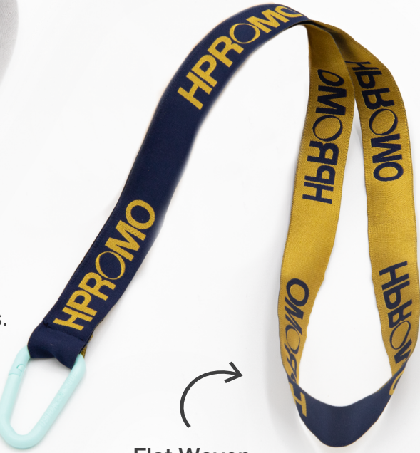
Flat Woven Low Budget Woven Jacquard RIBBON printed in 2 colors.