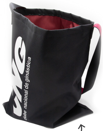
StrongSack Bag made from Nylon material.