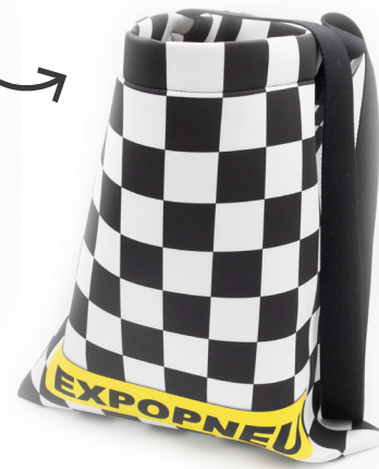
NeoSack Bag made with SEAQUAL recycled polyester.